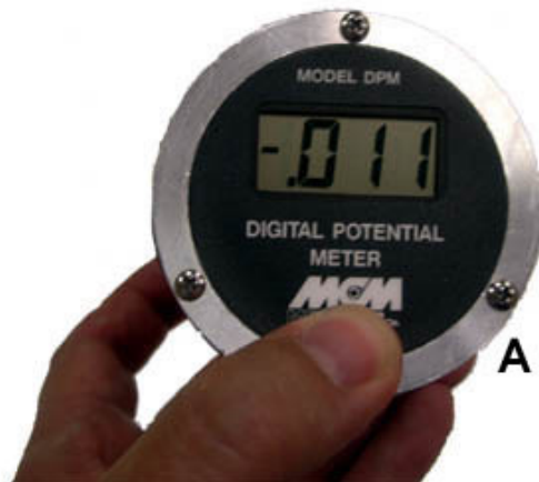
A – 3 SCREWS (Remove to get to Battery)